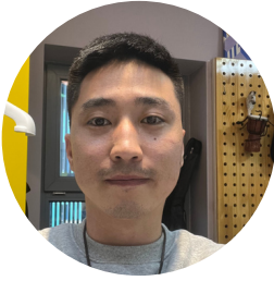
TURMUNKH BATCHULUUN ACTOR- CREATIVE BAMBOO