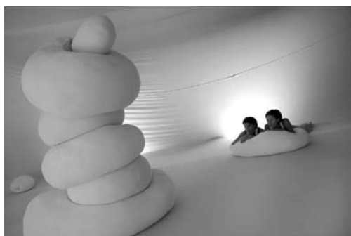
Little Theater "Dusko Radovic", Belgrade