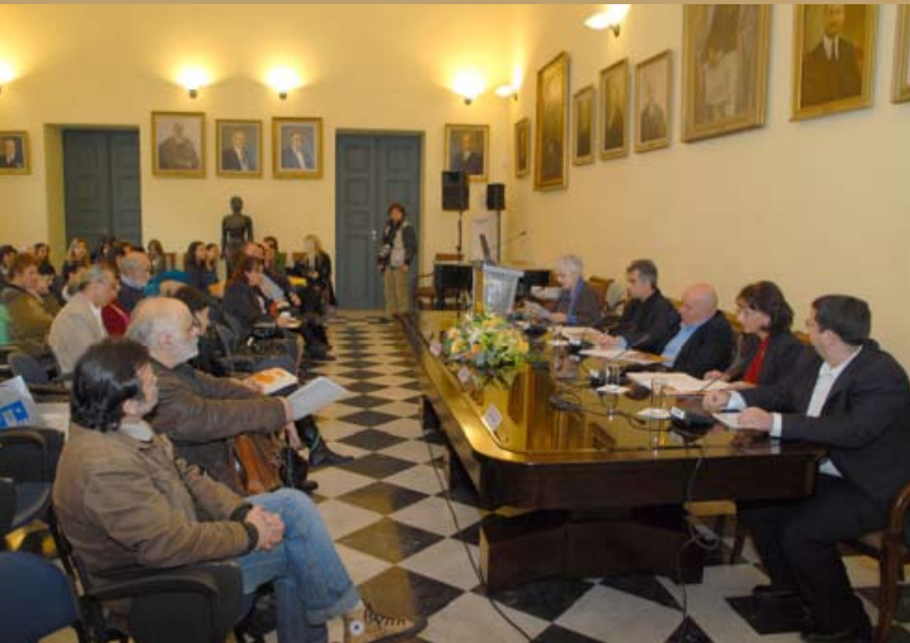
From the conference in Athens with the title "CHILD - THEATRE – DANCE" November 2008.