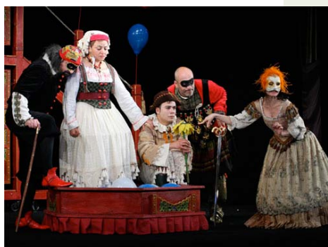
Teatrul Ion Creanga The Magic Seed

The project focuses on promoting the Romanian artist's value dedicated to very young audience and underlying the tremendous role of children's theatre, not only as a superior form of entertainment and relaxation, but also educationally and socially. The 4th edition of the festival was held in Bucharest October 4 - 11 and was designated an ASSITEJ International Festival.