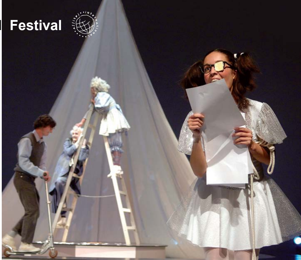
National Theatre Varaždin, Croatia, White Clown

The Second Epifest was the biggest meeting in theatre for children and young people in Croatia. It gathered artists from 25 countries, offered a very rich program of performances and workshops and defined a big step in the development of theatre for children in Croatia. Some of the merit goes to ASSITEJ International General Secretariat / Theatre Epicentre, initiator and co-organizer of all the events.