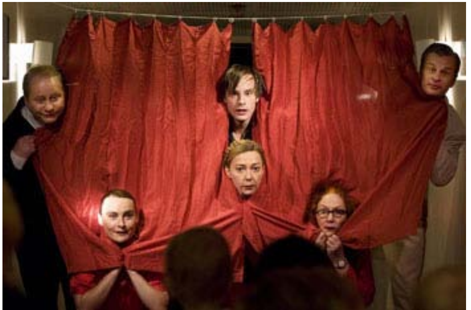
Babydrama Unga Klara, Sweden

Great interest that filled the auditorium with number of visitors, educators, creators and artists, speaks for itself about quality and importance of this years program. It started with round table "The new roles of the theatre for new generations", which caused long discussion with many participants. The first week of program was focused on different forms of theatre practice and creative work in education, prison, inclusive processes /projects. In second week professional theatre productions encourage audience to participate in interaction, discussions and work demonstrations before and after each performance. Most of themes this year were devoted to the sexual health problems trough several stage of childhood/youth. This vivid interaction among audience and artists bring