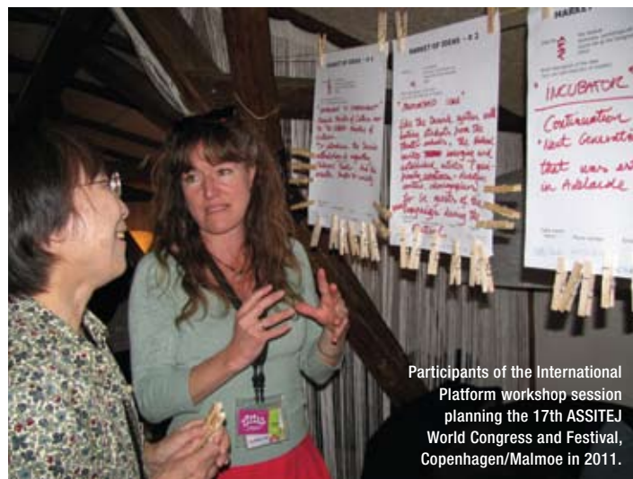
Participants of the International Platform workshop session planning the 17th ASSITEJ World Congress and Festival, Copenhagen/Malmoe in 2011.

is being produced for young people in Denmark.