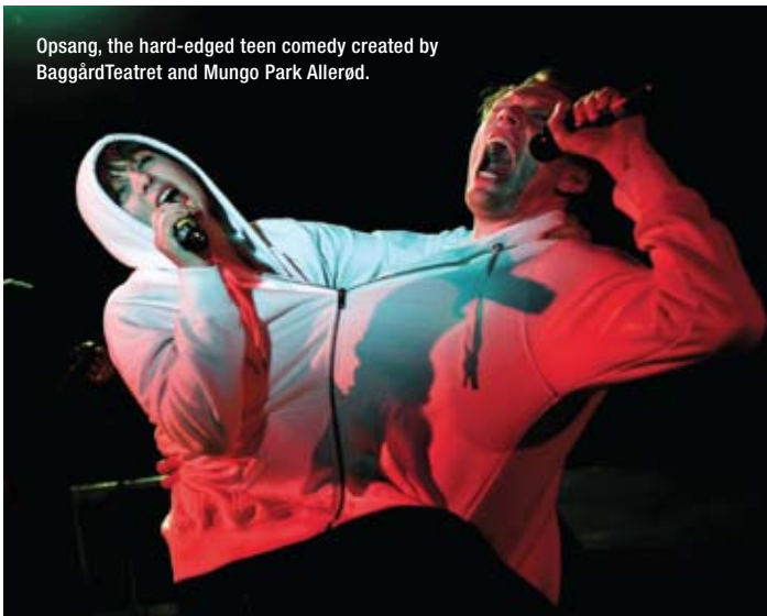
Opsang, the hard-edged teen comedy created by BaggårdTeatret and Mungo Park Allerød.

Theatre for teenagers with political themes addressing social, cultural and political issues was quite prevalent within the program. Opsang (The Lecture) was one of my picks of the festival. Musical theatre 'handing out theatrical wallops and musical slaps to the Danish youth'. It was delivered in the form of a teaching lecture and took the mostly older teen audience through the seven deadly sins with a brash and raw musical dialogue that worked its way through the sins in ways that remained connected to a teenager's world. Other pieces covered issues such as loneliness and cyber-relationships (Graense-Loes's, Fucking Alone ) and Cut which took on self mutilation and self harming.